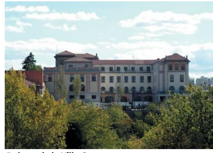
Dehesa de la Villa Campus Located in the university area of Madrid

Professors with an extensive academic background and wide-ranging educational and research experience.